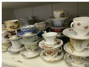
Photo from the Butler's pantry featuring the Prop teacup collection.

If you have stories that you would like to share please contact LaurieAnne at 317-639-7881 x4. We will be featuring the ballroom in an upcoming video and are looking for photos and stories from Mrs. Gates's dance classes.