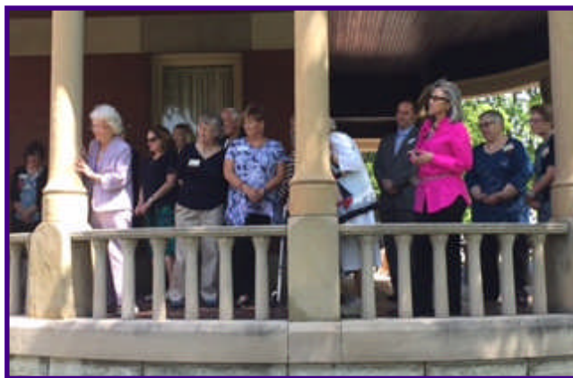
Guests watch the dedication ceremony.